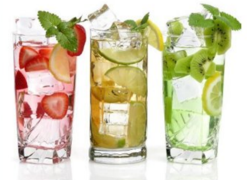
Consume lot of Water