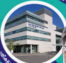
ആശുപത്രികളും നഴ്സിംഗ് ഹോമുകളും